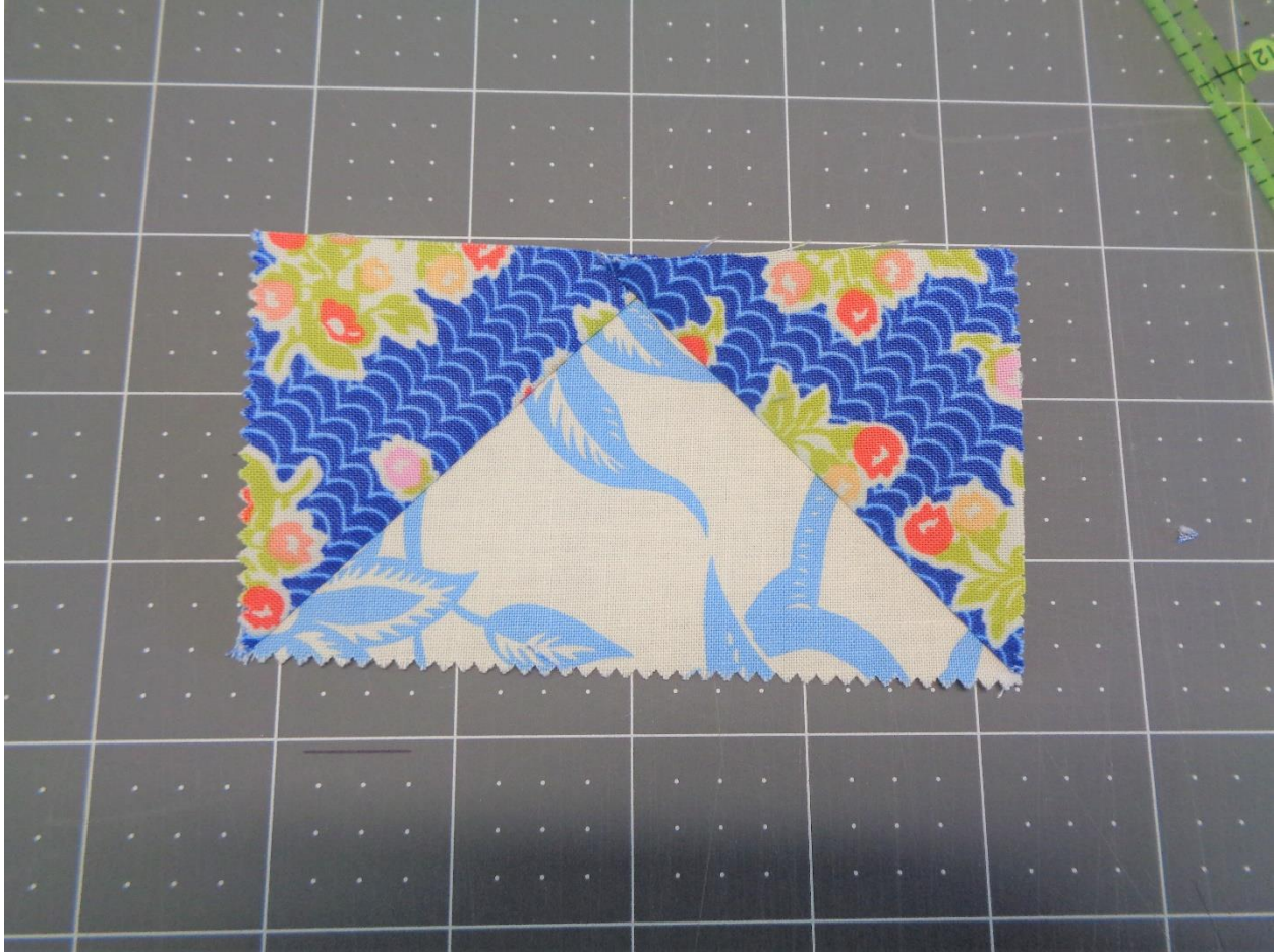
Your flying geese is complete!